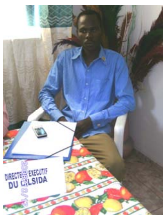
The Executive Director

We take advantage of this occasion to thank our partners, People's Health Movement (PHM), Fondation de France, the SP/CNLS-IST and the Centre Médico-Social d'Adamavo, including workshop heads, parents of students, and school principals, for their financial, technical and moral support leading to the success of this year's activities.